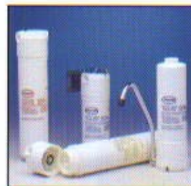
The Q-Series with the innovative Twist-Tap shut off valve and replaceable body.