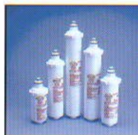
The E-Series designed as a replacement body for existing permanent head systems.