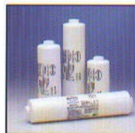
The K-Series with the unique Quick-Connect fittings

Available in all Omnipure filter bodies as well as cartridge elements.